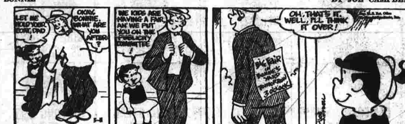
BY JOE CAMPBELL