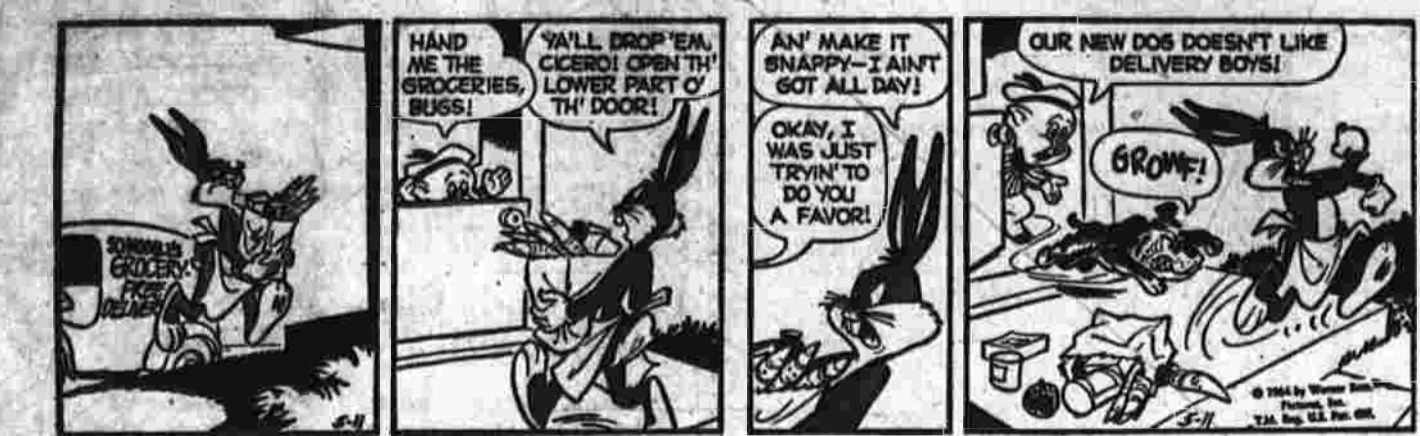
ANY MAKE IT SNAPPY-I AIN'T GOT ALL DAY